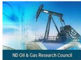
ND Oil & Gas Research Council