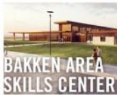
BAKKEN AREA SKILLS CENTER